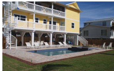
Tarpon Tales — Brand New Island Home

The Tarpon Tales is a magnificent brand new luxury home located on Boca Grande. This home features 5 bedrooms, 5 bathrooms, private pool, 8-person outdoor hot tub with spill-over, and pool bar. The Tarpon Tales will comfortably sleep 14 in beds. No detail has been missed. A rooftop observation deck provides breathtaking sunrises and sunsets with 360 degree panorama of the Gulf of Mexico and Gasparilla Sound