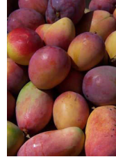
Delicious Mangos of many varieties

Did you know that no other states report the production of mangos? Consequently, Florida is the main United States producer of this fruit. Mango Mania is a festival held at the German American Social Club, 2101 S.W. Pine Island Road, Cape Coral during the month of July. Festival-goers can taste and buy their fill of just-picked mangoes of assorted varieties, many not available in supermarkets. They can learn how to grow their own and buy a tree. There's music, dancing and even some non-mango comestibles for anyone who simply can't live on mangoes alone.