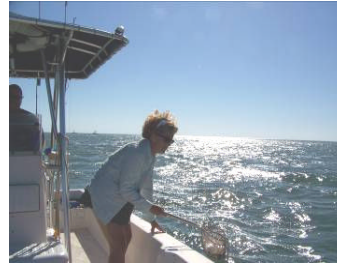
Searching for the Pass Crabs

Pass Crabs are almost identical to Blue Crabs in shape, but they only grow to approximately four to five inches in width. You can catch Pass Crabs in South Florida during the outgoing tide on the surface, usually floating along with grass. You simply take a long handled net and dip them out of the water. There are a few bait shops in South Florida that sell them, but they are few and far between. Pass Crabs are primarily used for tarpon in the Boca Grande area, but they are just as good, maybe better, than blue crabs for a variety of fish. To use them as bait, hook them the same way as Blue Crabs, through the back leg and out the top shell.